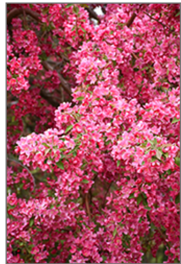
Prairifire Flowering Crab flowers