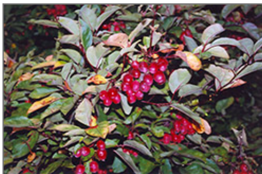
Adams Flowering Crab fruit

This tree should only be grown in full sunlight. It prefers to grow in average to moist conditions, and shouldn't be allowed to dry out. It is not particular as to soil type or pH. It is highly tolerant of urban pollution and will even thrive in inner city environments. This particular variety is an interspecific hybrid.