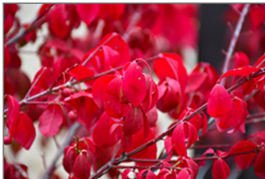
Rudy Haag Burning Bush in fall