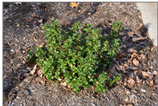
Emerald Magic Meserve Holly