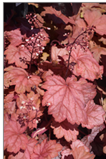
Georgia Peach Coral Bells in bloom