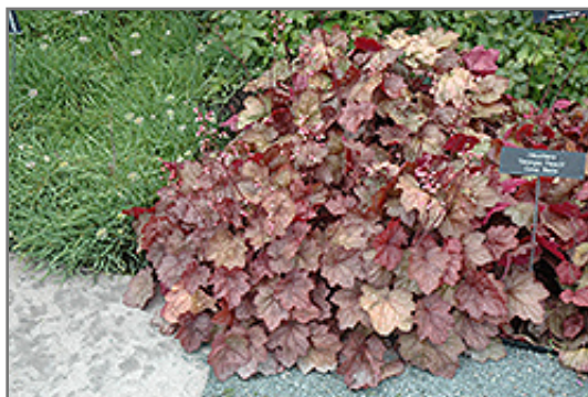
Georgia Peach Coral Bells

Georgia Peach Coral Bells is recommended for the following landscape applications;