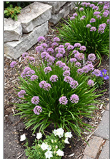
Summer Beauty Ornamental Chives in bloom

Summer Beauty Ornamental Chives is recommended for the following landscape applications;