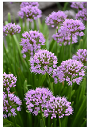
Summer Beauty Ornamental Chives flowers