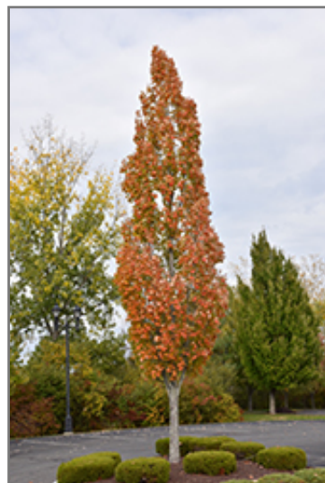
Armstrong Maple in fall

This tree should only be grown in full sunlight. It is quite adaptable, preferring to grow in average to wet conditions, and will even tolerate some standing water. It is not particular as to soil type or pH. It is highly tolerant of urban pollution and will even thrive in inner city environments. This particular variety is an interspecific hybrid.