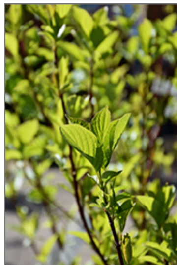
Bailey Red-Twig Dogwood foliage

This shrub does best in full sun to partial shade. It is an amazingly adaptable plant, tolerating both dry conditions and even some standing water. It is not particular as to soil type or pH. It is highly tolerant of urban pollution and will even thrive in inner city environments. This species is native to parts of North America.