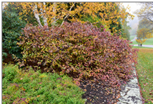
Bailey Red-Twig Dogwood in fall