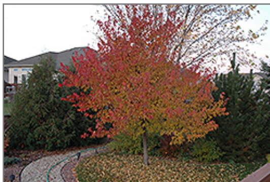
Embers Amur Maple in fall