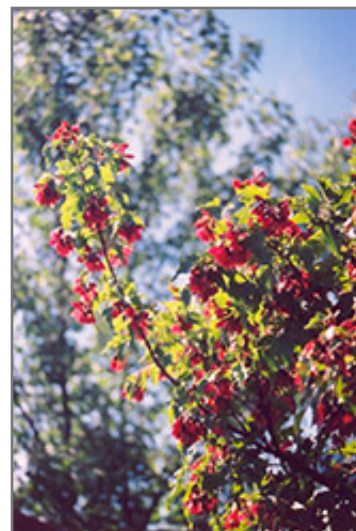
Embers Amur Maple fruit

This tree does best in full sun to partial shade. It is very adaptable to both dry and moist locations, and should do just fine under average home landscape conditions. It is not particular as to soil type or pH. It is highly tolerant of urban pollution and will even thrive in inner city environments. This is a selected variety of a species not originally from North America.