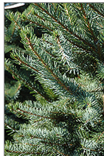
Bruns Spruce foliage