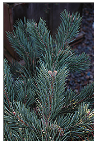
Albyn Prostrate Scotch Pine foliage