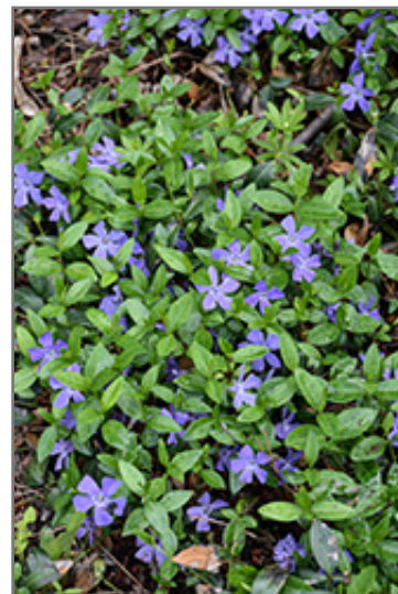
Common Periwinkle flowers