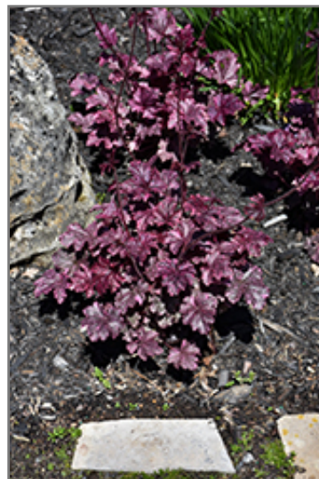
Midnight Rose Coral Bells