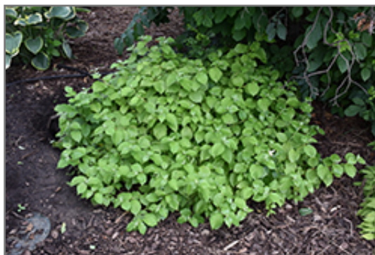
Arctic Sun Dogwood