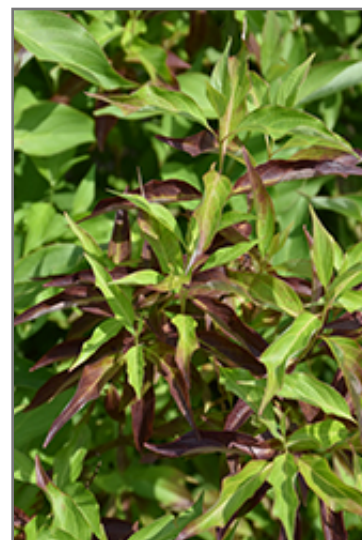
Red Gnome Dogwood foliage