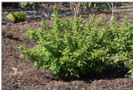
Red Gnome Dogwood