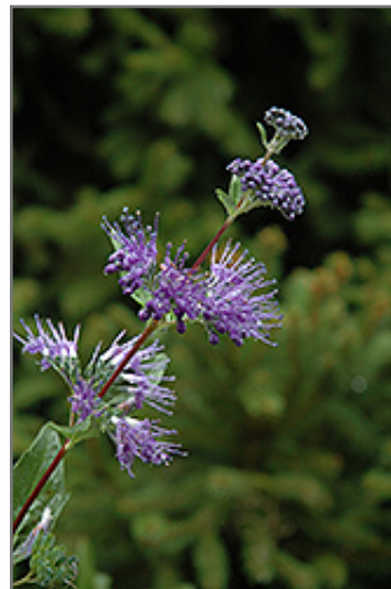
Blue Mist Caryopteris flowers

Blue Mist Caryopteris is recommended for the following landscape applications;