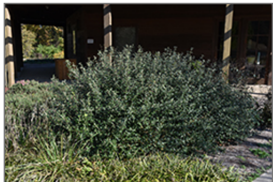
Prague Viburnum