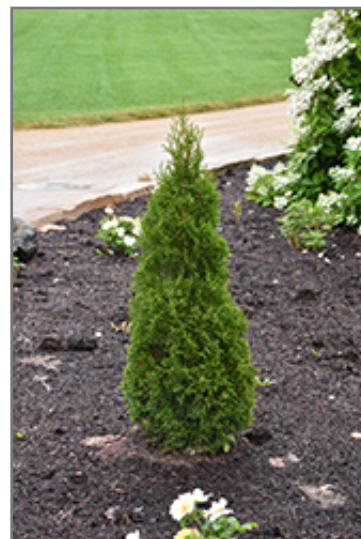
Emerald Squeeze Arborvitae flowers