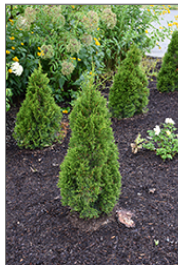
Emerald Squeeze Arborvitae