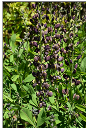
Chocolate Chip False Indigo flowers