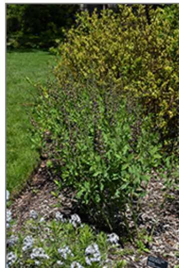
Chocolate Chip False Indigo in bloom