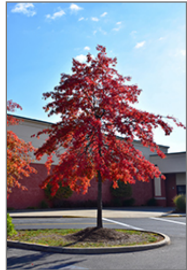
Pin Oak in fall