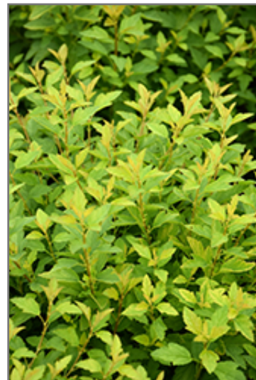
Raspberry Lemonade Ninebark foliage

Raspberry Lemonade Ninebark is recommended for the following landscape applications;