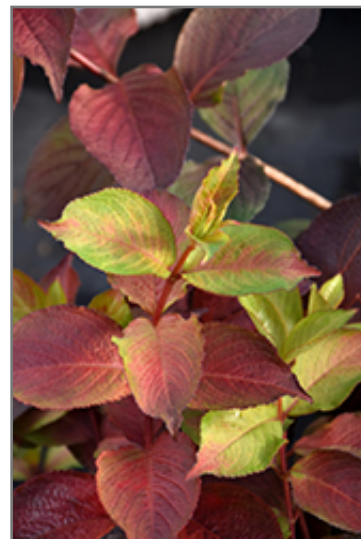
Midnight Sun Reblooming Weigela foliage