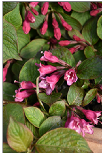
Midnight Sun Reblooming Weigela flowers

Midnight Sun Reblooming Weigela makes a fine choice for the outdoor landscape, but it is also well-suited for use in outdoor pots and containers. It is often used as a 'filler' in the 'spiller-thriller-filler' container combination, providing a mass of flowers and foliage against which the thriller plants stand out. Note that when grown in a container, it may not perform exactly as indicated on the tag - this is to be expected. Also note that when growing plants in outdoor containers and baskets, they may require more frequent waterings than they would in the yard or garden.