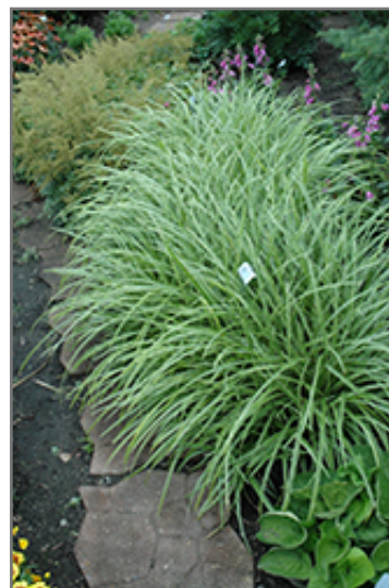
Ice Dance Sedge

Ice Dance Sedge is recommended for the following landscape applications;