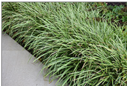
Ice Dance Sedge

Ice Dance Sedge will grow to be about 12 inches tall at maturity, with a spread of 15 inches. Its foliage tends to remain dense right to the ground, not requiring facer plants in front. It grows at a medium rate, and under ideal conditions can be expected to live for approximately 10 years. As an evergreen perennial, this plant will typically keep its form and foliage year-round.