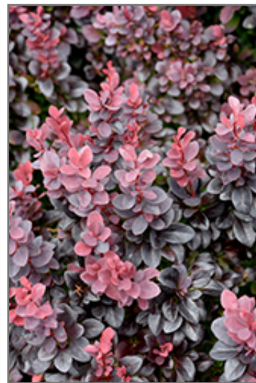
Concorde Japanese Barberry foliage