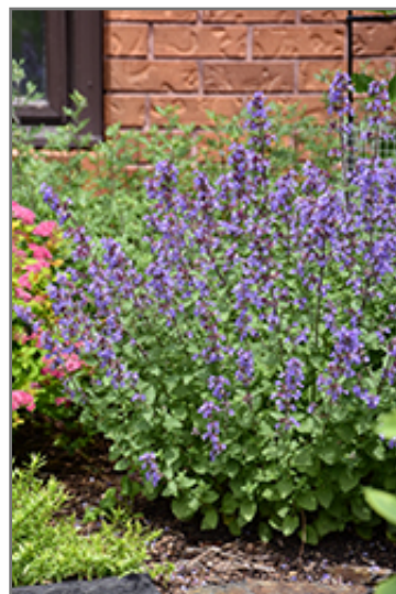
Picture Purrfect Catmint flowers

Picture Purrfect Catmint is a dense herbaceous perennial with a mounded form. Its relatively fine texture sets it apart from other garden plants with less refined foliage.