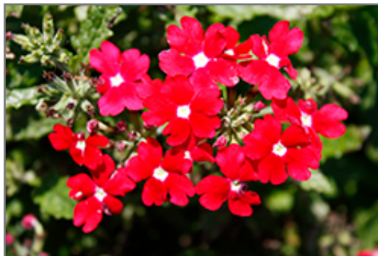
Cadet Upright Red Verbena flowers

Cadet Upright Red Verbena is recommended for the following landscape applications;