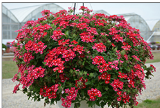
Cadet Upright Red Verbena in bloom

Cadet Upright Red Verbena will grow to be about 10 inches tall at maturity, with a spread of 14 inches. When grown in masses or used as a bedding plant, individual plants should be spaced approximately 10 inches apart. Its foliage tends to remain low and dense right to the ground. This fast-growing annual will normally live for one full growing season, needing replacement the following year.