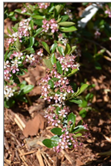
Ground Hug Aronia flowers