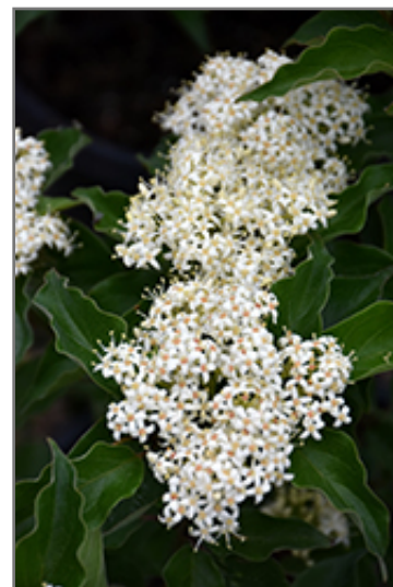
Rough-leaved Dogwood flowers

Rough-leaved Dogwood is recommended for the following landscape applications;