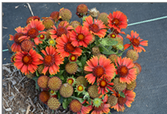
SpinTop Yellow Touch Blanket Flower in bloom