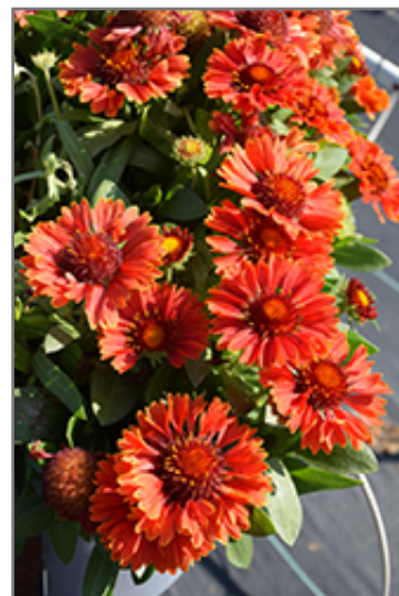
SpinTop Yellow Touch Blanket Flower flowers

SpinTop Yellow Touch Blanket Flower is a dense herbaceous perennial with a mounded form. Its relatively fine texture sets it apart from other garden plants with less refined foliage.