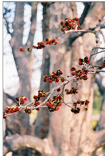
Persian Parrotia flowers

This tree should only be grown in full sunlight. It is very adaptable to both dry and moist locations, and should do just fine under average home landscape conditions. It is not particular as to soil type or pH. It is highly tolerant of urban pollution and will even thrive in inner city environments. This species is not originally from North America.