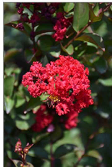
Princess Zoey Crapemyrtle flowers