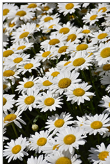
Becky Shasta Daisy flowers