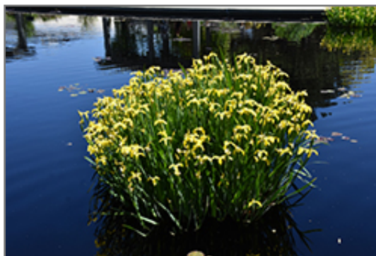
Yellow Flag Iris in bloom