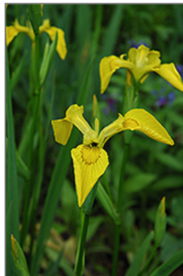
Yellow Flag Iris flowers