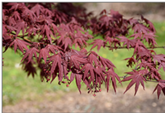
Hefner's Red Select Japanese Maple foliage