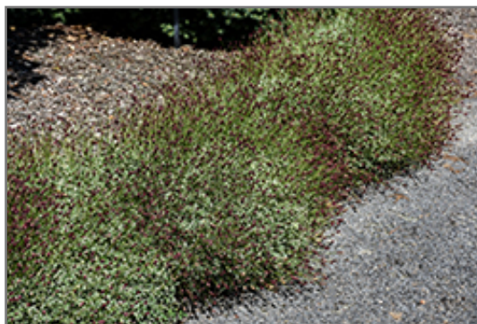
Little Angel Burnet in bloom