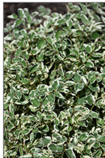
Little Angel Burnet flowers

This plant does best in full sun to partial shade. It prefers to grow in average to moist conditions, and shouldn't be allowed to dry out. It is not particular as to soil type or pH. It is somewhat tolerant of urban pollution. This is a selected variety of a species not originally from North America. It can be propagated by division; however, as a cultivated variety, be aware that it may be subject to certain restrictions or prohibitions on propagation.