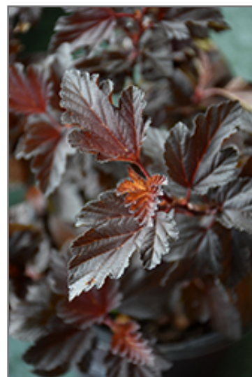
Fireside Ninebark flowers