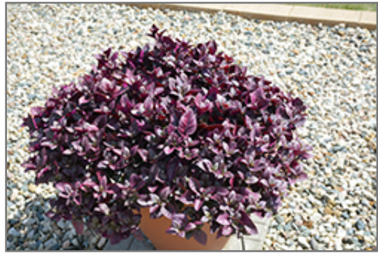
Purple Prince Alternanthera

Purple Prince Alternanthera will grow to be about 14 inches tall at maturity, with a spread of 20 inches. When grown in masses or used as a bedding plant, individual plants should be spaced approximately 14 inches apart. Its foliage tends to remain dense right to the ground, not requiring facer plants in front. Although it's not a true annual, this fast-growing plant can be expected to behave as an annual in our climate if left outdoors over the winter, usually needing replacement the following year. As such, gardeners should take into consideration that it will perform differently than it would in its native habitat.