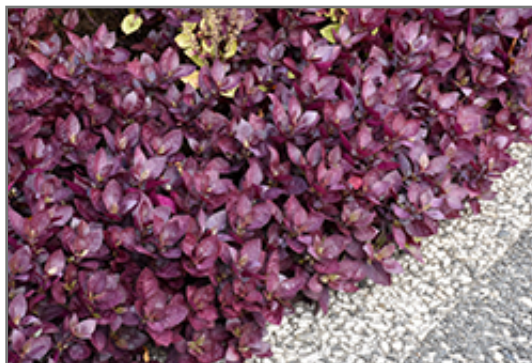
Purple Prince Alternanthera