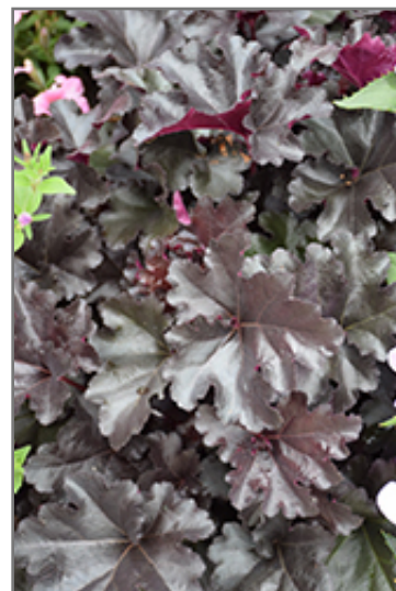
Black Pearl Coral Bells foliage

Black Pearl Coral Bells is recommended for the following landscape applications;