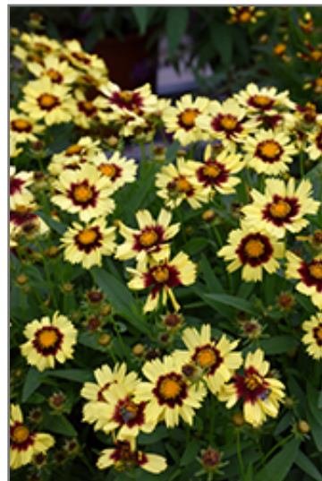
UpTick Yellow and Red Tickseed flowers

UpTick Yellow and Red Tickseed is a fine choice for the garden, but it is also a good selection for planting in outdoor pots and containers. It is often used as a 'filler' in the 'spiller-thriller-filler' container combination, providing a mass of flowers against which the thriller plants stand out. Note that when growing plants in outdoor containers and baskets, they may require more frequent waterings than they would in the yard or garden.