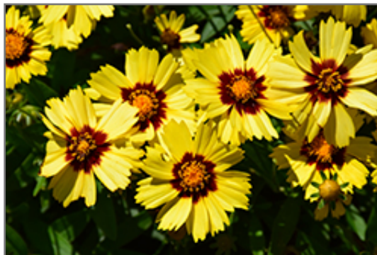
UpTick Yellow and Red Tickseed flowers

UpTick Yellow and Red Tickseed is recommended for the following landscape applications;