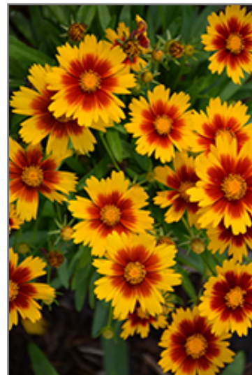
UpTick Gold and Bronze Tickseed flowers

UpTick Gold and Bronze Tickseed is recommended for the following landscape applications;