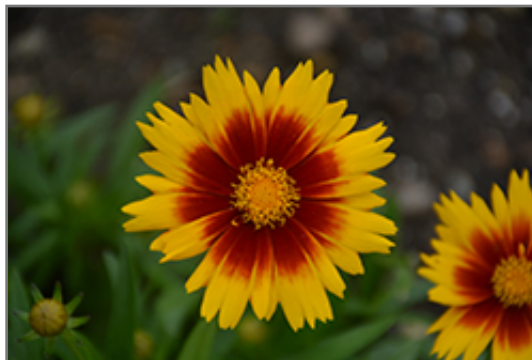
UpTick Gold and Bronze Tickseed flowers

UpTick Gold and Bronze Tickseed will grow to be about 12 inches tall at maturity, with a spread of 14 inches. Its foliage tends to remain dense right to the ground, not requiring facer plants in front. It grows at a medium rate, and under ideal conditions can be expected to live for approximately 10 years. As an herbaceous perennial, this plant will usually die back to the crown each winter, and will regrow from the base each spring. Be careful not to disturb the crown in late winter when it may not be readily seen!