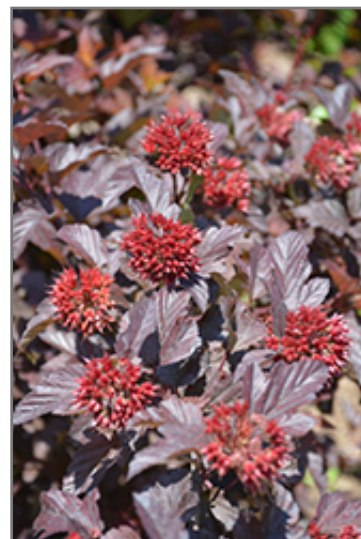
Ginger Wine Ninebark flower buds

This is a relatively low maintenance shrub, and can be pruned at anytime. It has no significant negative characteristics.