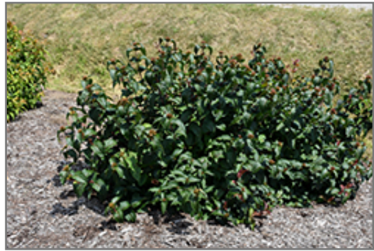
Kodiak Black Diervilla