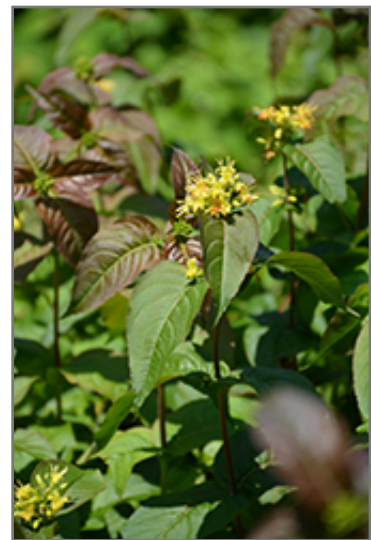
Kodiak Black Diervilla flowers