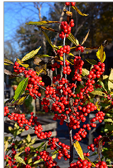
Winterberry fruit

Winterberry is recommended for the following landscape applications;