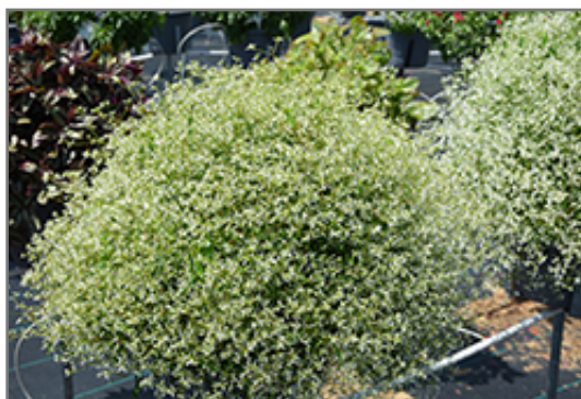
Glitz Euphorbia in bloom