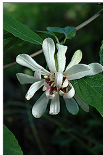
Venus Sweetshrub flowers

Venus Sweetshrub will grow to be about 6 feet tall at maturity, with a spread of 6 feet. It tends to fill out right to the ground and therefore doesn't necessarily require facer plants in front, and is suitable for planting under power lines. It grows at a medium rate, and under ideal conditions can be expected to live for approximately 20 years.