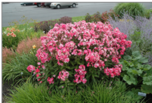
Garden Girls Glamour Girl Garden Phlox in bloom

Garden Girls Glamour Girl Garden Phlox will grow to be about 28 inches tall at maturity, with a spread of 24 inches. When grown in masses or used as a bedding plant, individual plants should be spaced approximately 18 inches apart. It grows at a medium rate, and under ideal conditions can be expected to live for approximately 10 years. As an herbaceous perennial, this plant will usually die back to the crown each winter, and will regrow from the base each spring. Be careful not to disturb the crown in late winter when it may not be readily seen!