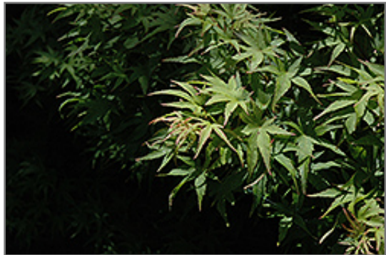
Akita Yatsubusa Japanese Maple foliage