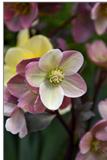
Pink Frost Hellebore flowers