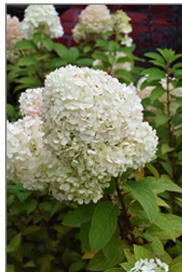
Bobo Hydrangea flowers