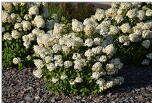
Bobo Hydrangea in bloom