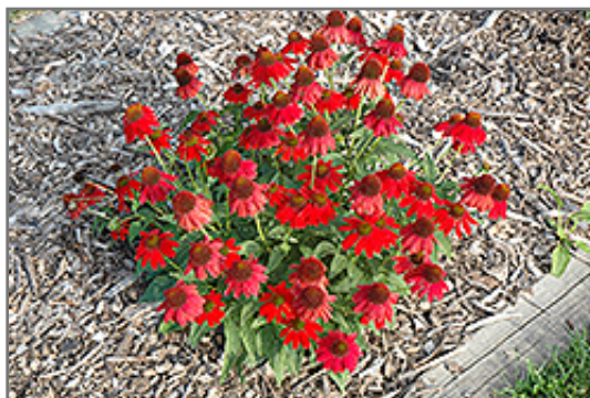
Sombrero Salsa Red Coneflower in bloom

Sombrero Salsa Red Coneflower is a fine choice for the garden, but it is also a good selection for planting in outdoor pots and containers. With its upright habit of growth, it is best suited for use as a 'thriller' in the 'spiller-thriller-filler' container combination; plant it near the center of the pot, surrounded by smaller plants and those that spill over the edges. Note that when growing plants in outdoor containers and baskets, they may require more frequent waterings than they would in the yard or garden.